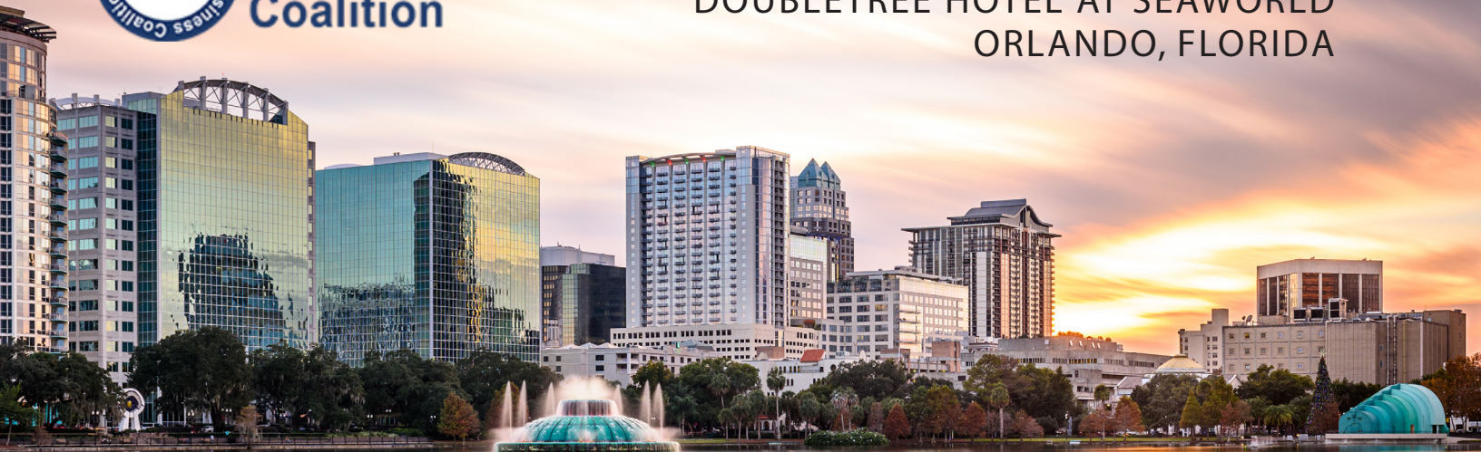
EXHIBIT & SPONSORSHIP

DOUBLETREE HOTEL AT SEAWORLD ORLANDO, FLORIDA